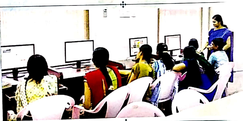
INFLIBNET Literacy programme for PG Students

On 24th Nov 2014, an Orientation program was held for I year PG students to utilize N-List Program for their research work. This created awareness about the INFLIBNET Database remote access facility available in the library.