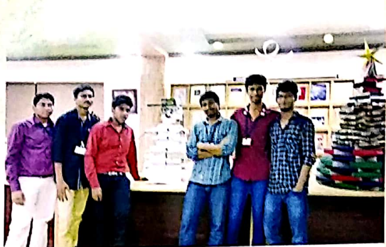
Christmas Theme In the Library