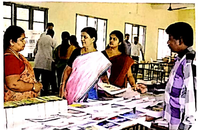
Principal Visiting the book fair