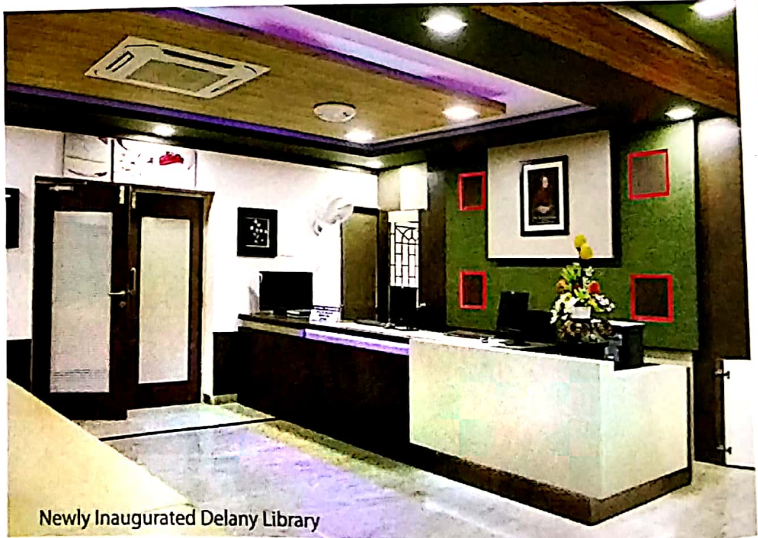
Newly Inaugurated Delany Library