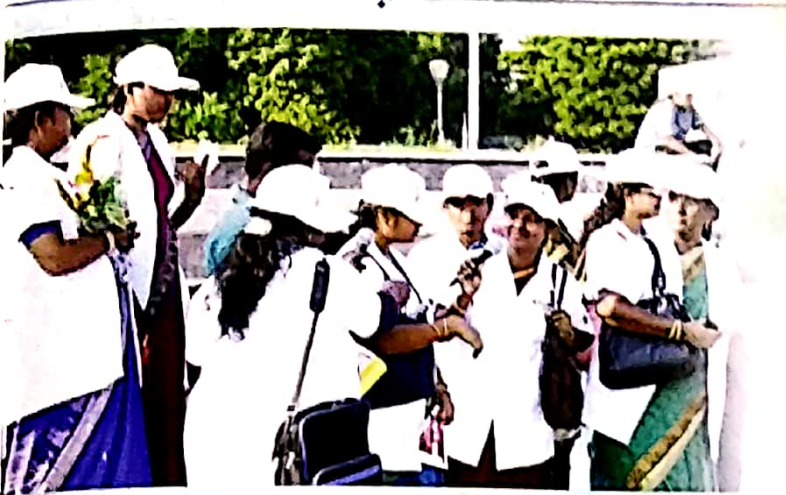
Librarians taking Oath with students