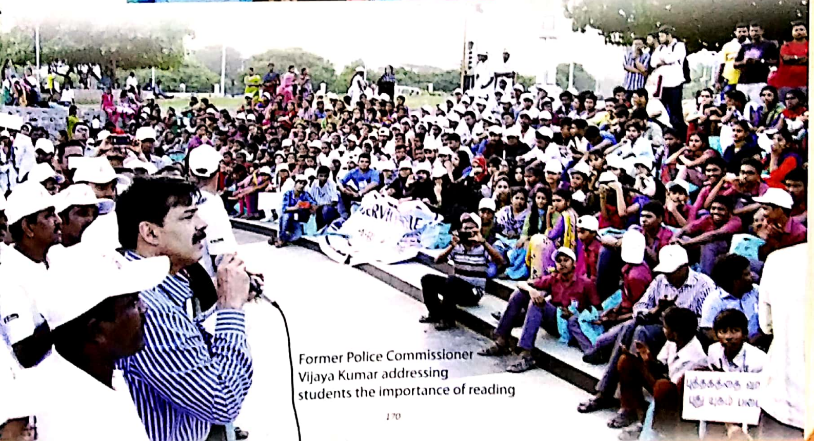
Former Police Commissioner Vijaya Kumar addressing students the importance of reading